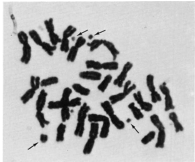
Fig. 1. Metaphase spread from haploid embryo, in which several supernumerary chromosome fragments were detected

The 50 caryological examinations performed on embryos from the batches fertilized with irradiated sperm without heat shock, revealed only haploid metaphases. Nevertheless, in some spreads, we observed near the chromosomes one or several chromosome fragments, and we think they are residues of paternal chromatin because we never saw them in diploid control metaphases (Fig. 1).